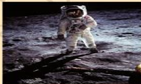
Fig. 17.8 : An astronaut on the moon

On July 21, 1969 (Indian time) the American astronaut, Neil Armstrong, landed on the moon for the first time. He was followed by Edwin Aldrin.