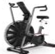
Schwinn Airdyne AD7 Bike