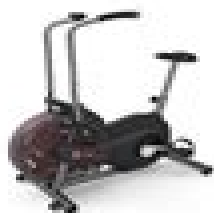
Schwinn Airdyne AD2 Bike