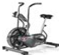
Schwinn Airdyne AD6 Bike