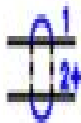
Cable with Shield