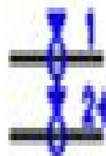
Shield Tied Back