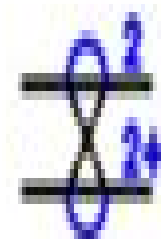
Twisted Pair with Shield (...)