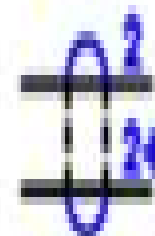
Cable with Shield (all 2nd)