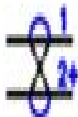
Twisted Pair with Shield