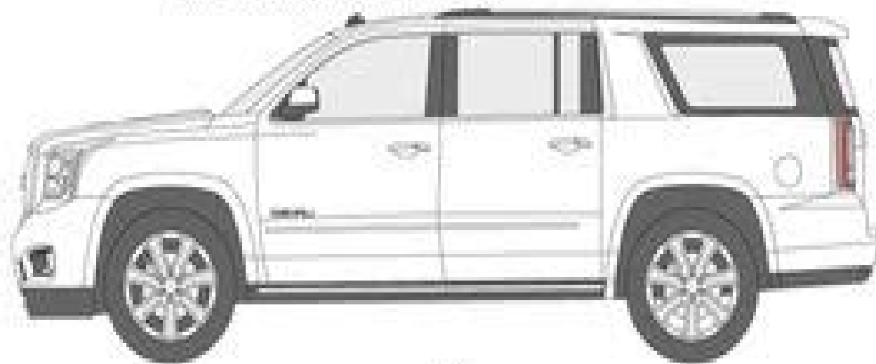
GMC Yukon XL Denali (2014)