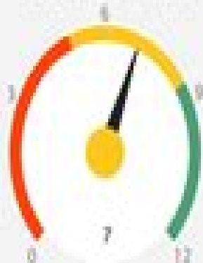
YTD Sales vs Last Yr ($M)