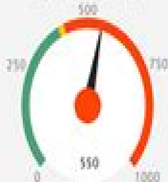
Net Sales vs Last Yr ($M)