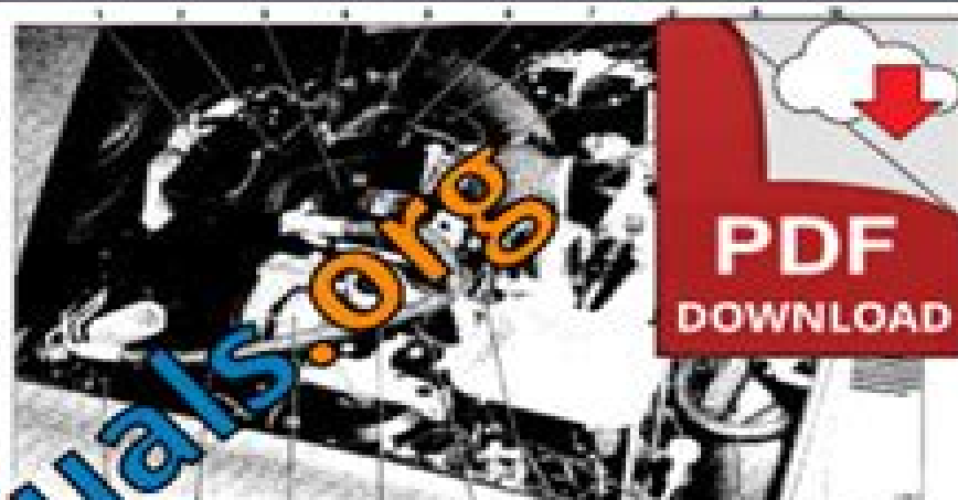
Fig. 10. Nominal rates of engine conversion. Note: same

4. The great damage to the coastal zone follows landfall, care should be taken not to compromise the impact of the studies on the present coastal zoning system necessary.