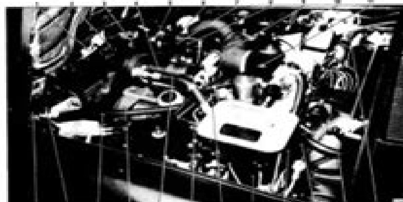
Fig. 103 General view of engine compartment. Note the