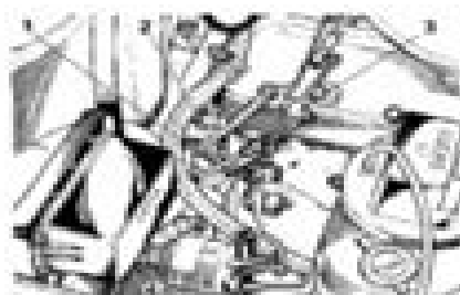
FIG. 1B COMPENSATOR LINKAGE AND REMOTE STARTER MOTOR SWITCH (dry gas)

1 Long bolt and nut 2 Control rod 3 Compensator linkage 4 Remote starter switch