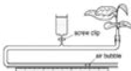
Why it is an issue (PQW)

A number of questions will ask you to calculate the volume of water lost over a period of time/ the rate of water loss. To convert the distance moved by the _____ to volume you need to use the equation _____. This will give the _____ of a cylinder and therefore the volume of water that has moved into the plant. To measure the rate of _____ the volume of water taken in by the plant should be divided by the time taken for this to occur. This is usually given in the units _____ (centimetres cubed per minute).