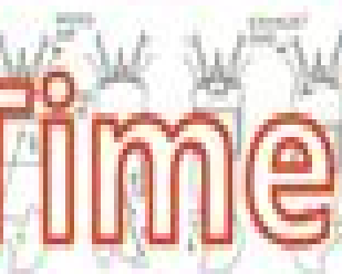
Diagram of 4-Stroke Cycle Engine