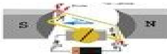
The motor principle