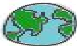
Plate Tectonics Crossword Puzzle