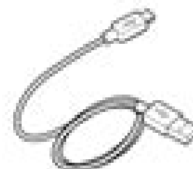
Micro USB cable