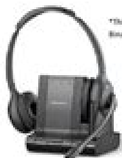
*This picture shows the Binaural (W710-M) version

Using a Plantronics Savi headset for PC calls will deliver a simpler, more comfortable and better sounding audio experience than you could get using just your computer's internal microphone and speaker.