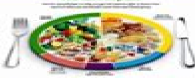
The eatwell plate

A healthy BALANCED diet contains the right balance of the different nutrients from foods you need and the right amount of energy. Mineral ions (e.g. iron, calcium) and vitamins (e.g. A, C, D) are needed in small amounts for healthy functioning of the body. If your diet is not BALANCED a person can become MALNOURISHED (e.g. over/underweight or suffer from a deficiency disease).