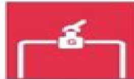
Gas Shutoff Valve