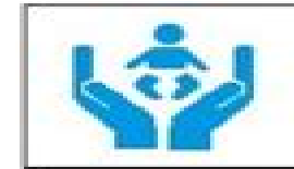
Child Care Center