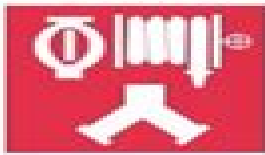
Fire Department Combined Automatic Sprinkler/Standpipe Connection