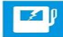
Electric Panel or Electric Shutoff