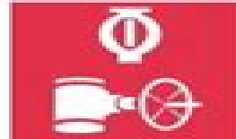
Automatic Sprinkler Control Valve