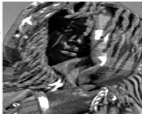
RETURNING HOME The young initiates are being offered the alcohol, which is the main and the most important part of the ceremony and is a tradition.