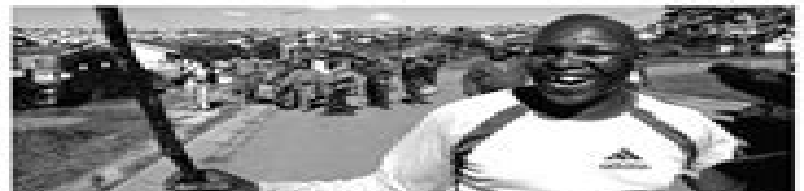
RETURNING HOME An unlituethus is being offered the alcohol and other to be accepted in a village.