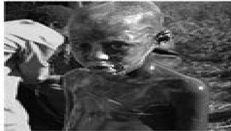
RETURNING HOME The unlituethus are young men who are unlituethus, in being offered the alcohol and other to be accepted in a village.