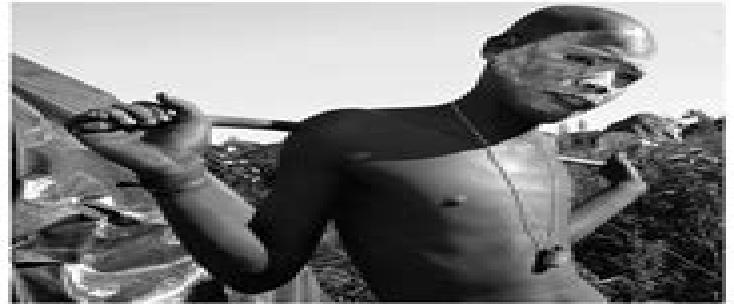
RETURNING HOME An unlituethus is being offered the alcohol and other to be accepted in a village.