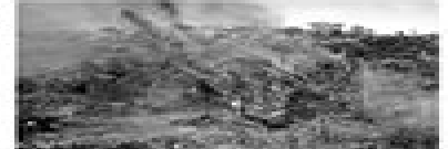
RETURNING HOME An unlituethus is being offered the alcohol and other to be accepted in a village.