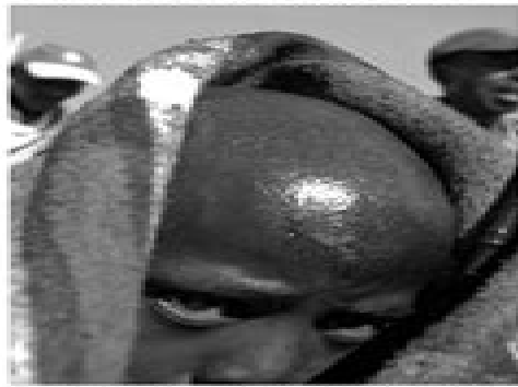
RETURNING HOME The boy who looks after the unlituethus' needs helps them to find their way to his home in the village.