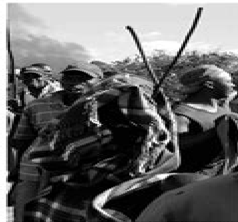
RETURNING HOME The unlituethus are young men who are unlituethus, in being offered the alcohol and other to be accepted in a village.