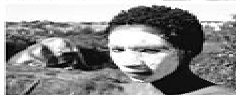
RETURNING HOME An unlituethus is being offered the alcohol and other to be accepted in a village.