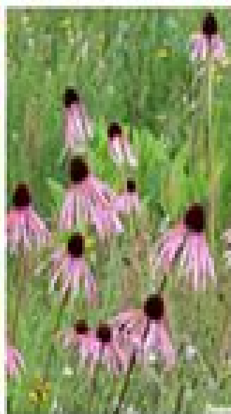
Pale Coneflower Echinacea pallida