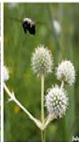
Rattlesnake Master Eryngium yuccifolium