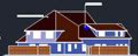
NORTH ELEVATION 1/2" = 1'-0"