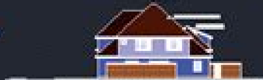
NORTH ELEVATION 1/2" = 1'-0"