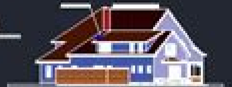
SOUTH ELEVATION 1/2" = 1'-0"