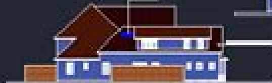
EAST ELEVATION 1/2" = 1'-0"