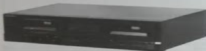
MECHANISM SERIES AR300