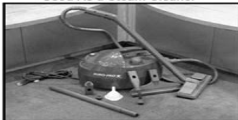
Used As a Steam Cleaner