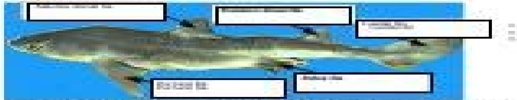
Figure 1. OpenStax Marine Biology: OpenStax is the open-source, peer-reviewed, and openly licensed educational resource for all. The image shows a blue shark swimming in the ocean. The shark has a long, slender body with a pointed snout and a large, open mouth showing sharp teeth. Its skin is a mottled blue-grey color. Several labels with black boxes are placed around the shark: 'Snout' at the front, 'Dorsal fin' on its back, 'Pectoral fin' on its side, 'Ventral fin' on its belly, and 'Anal fin' near its tail. A small label 'OpenStax' is also visible near the tail.

Figure 1. OpenStax Marine Biology: OpenStax