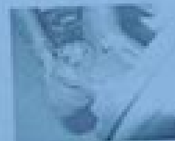
2-3 assemble onto