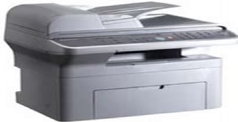
SAMSUNG SCX 4725 PRINTER