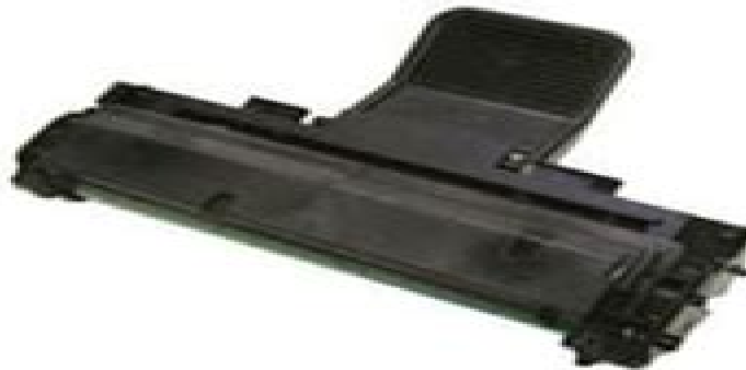
SAMSUNG SCX 4725 TONER CARTRIDGE