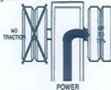
Figure 4 -- One Wheel Loss of Traction

75% OF AVAILABLE POWER IS TRANSFERRED TO THE WHEEL WITH TRACTION