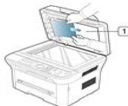
1. scanner lid