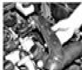
15.8 Undo the air cleaner start duct.