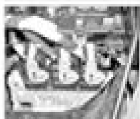
15.10 Express the retaining clip (arrow).