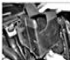
15.4 Remove the battery cover.

Undo the single filter retaining screw and disconnect the filter from the bracket. Disconnect the fuel heater and water (using spring clips, where fitted), so the filter is effectively disconnected.