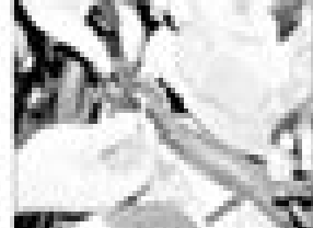
15.14 Remove the plastic wiring harness guide for access to the crankshaft position sensor.

Disconnect the battery (see Chapter 16).