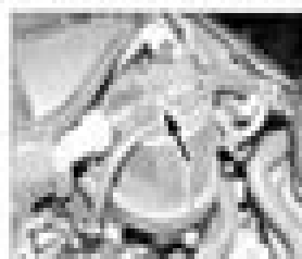
15.2 Loosen the vacuum pipe bracket cover (arrow).