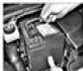
15.5 Undo the battery.