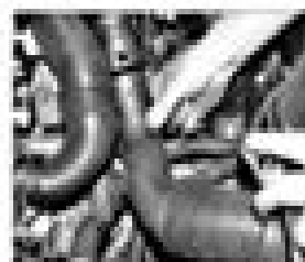
15.6 Remove the primary air filter duct.