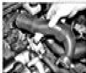
15.7 Disconnect the start duct.