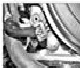
15.13 Disconnect the crankshaft position sensor wiring plug.

If these checks fail to reveal the cause of the problem, the vehicle should be taken to a Peugeot dealer or suitable equipped garage for testing. A diagnostic scanner is recommended for the use prior to the light of the warning system, to which a fault code reader or other suitable equipment can be connected by using the code reader or the equipment (through transponder ECU) and the vehicle after vehicle system (VDS) can be interrogated, and any stored fault codes can be viewed.