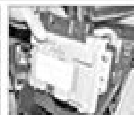
15.12 Undo the ECU from the electronic box.

increased emissions, to a repair for the engine to be completed.