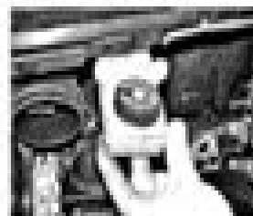
15.9 Disconnect the fuel-crossover sensor (arrow) to and with.