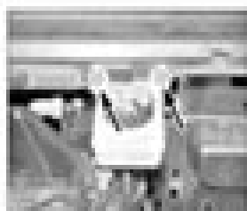
15.1 Disconnect the fuel-crossover sensor screen (arrow).