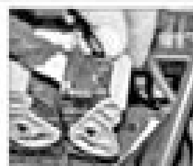
15.11 Undo the fuel feed from the bracket to horizontal position.