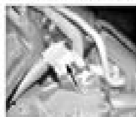
15.3 Express the battery (arrow) and disconnect the fuel feed and return pipes.

Disconnect the fuel-crossover sensor (see Illustration 15.1 ) and disconnect any fuel components.