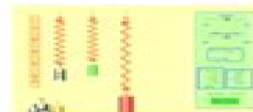
Masses & Springs

Period of a Spring: T = 2\pi\sqrt{\frac{m}{k}}