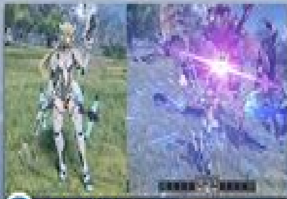
Gunner (Twin Machine Guns)