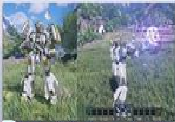
Ranger (Assault Rifle)