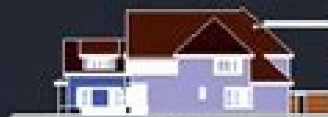
EASTMAN HOUSE EAST ELEVATION