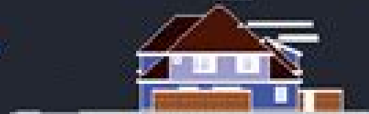
EASTMAN HOUSE EAST ELEVATION