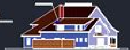
WESTMAN HOUSE WEST ELEVATION