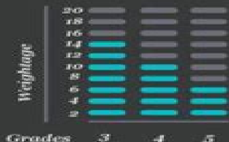
Operations and Algebraic Thinking (OA)