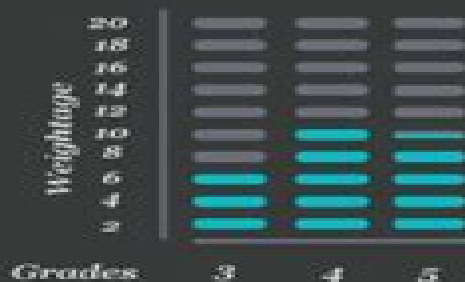
Number and Operations in Base 10 (NBT)