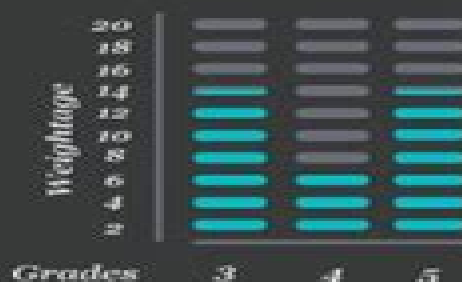
Measurement and Data (MD)