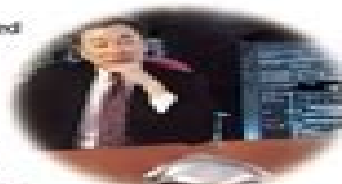
Conduct remote meetings...

If you work in a small to medium-sized business, chances are that you are still using low-quality, handset speakerphones to conduct important business with co-workers, and even customers. Handset speakerphones are fine for listening to voicemail or conducting short conversations, but usually fail to maintain natural two-way communication necessary to maximize productivity and conduct effect business meetings.