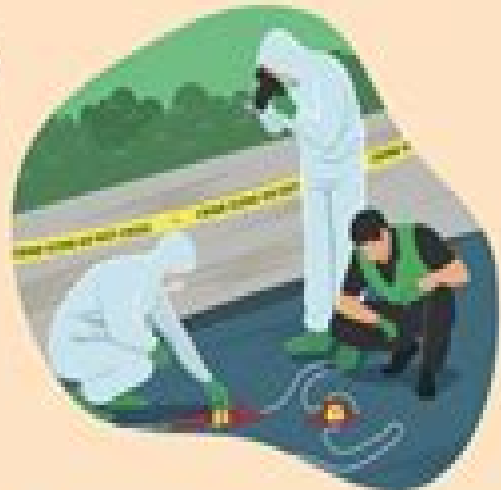
CSI (Crime Scene Investigation)