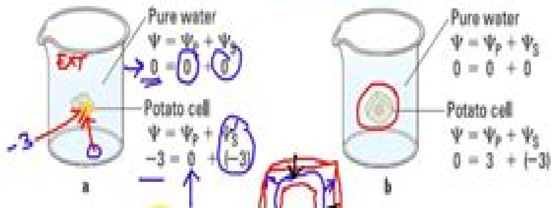
Figures 1a-b. Plant cell in pure water. The water potential was calculated at the beginning of the experiment (a) and after water movement reached dynamic equilibrium and the net water movement was zero (b).

\uparrow \Psi \rightarrow \downarrow \Psi } OSMOSIS - DIFFUSION