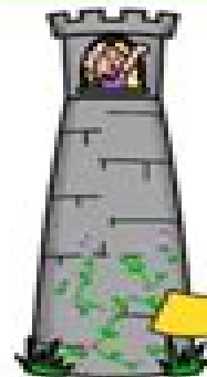
trapped in a tower