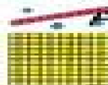
diagram Act out the problem or use objects