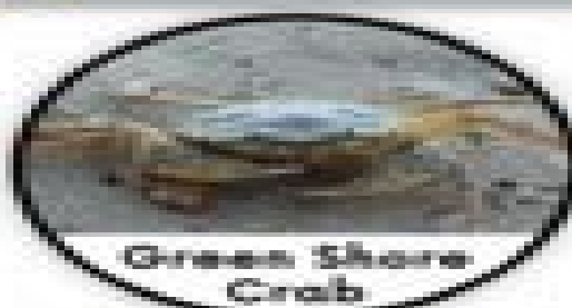
Green Shore Crab