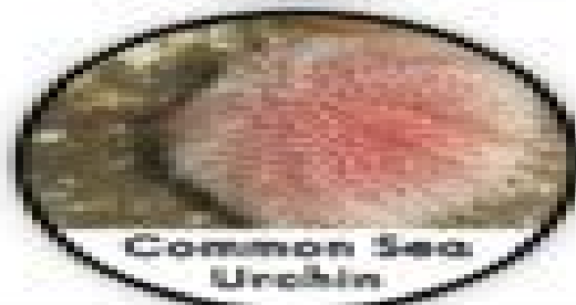
Common Sea Urchin