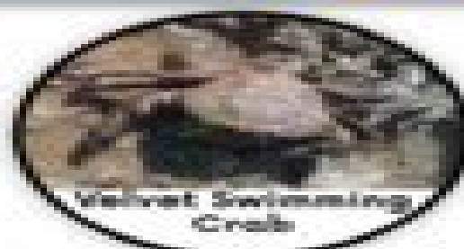
Velvet Swimming Crab