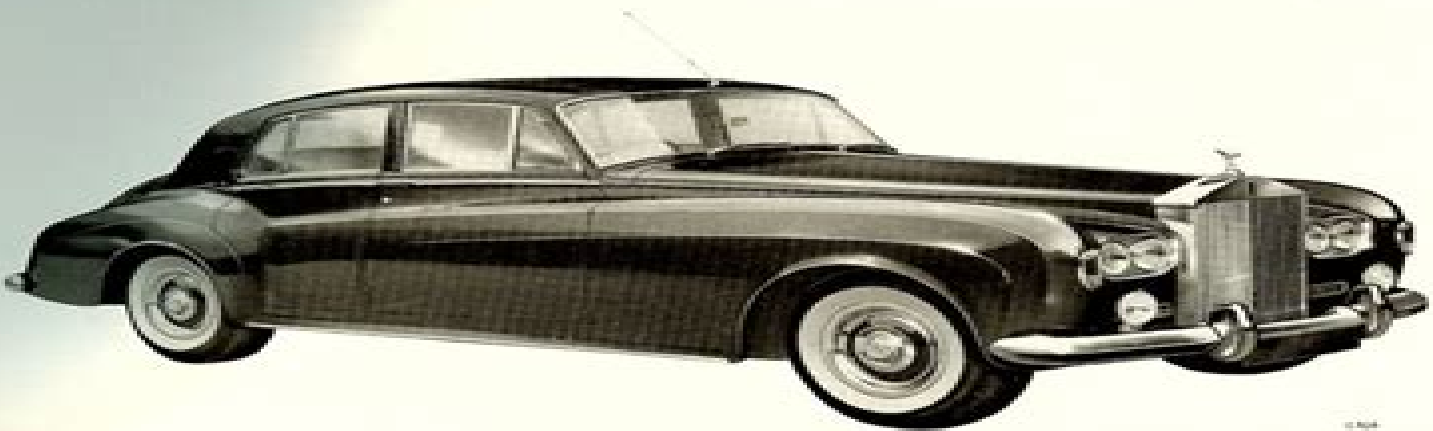
FIG. 1 THE ROLLS-ROYCE SILVER CLOUD III