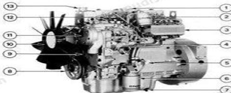
1004-4T DIESEL ENGINE SHOWN