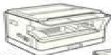
▲ AR-5618 ▲ AR-5618S/5620S ▲ AR-5618N ▲ AR-5618D