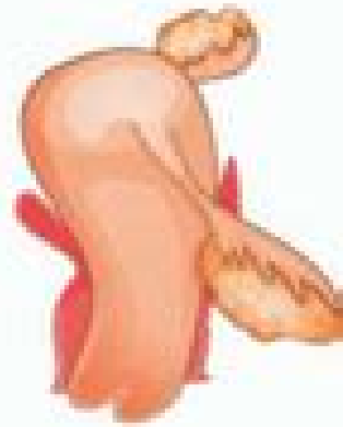
Stage III uterus protrudes