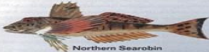
Northern Sea Robin