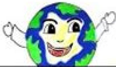
Structure of the Earth - Features