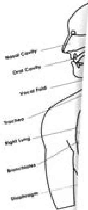
Respiratory System 2a