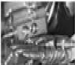
HOW TO USE The product is used in the kitchen.