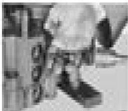
HOW TO USE The product is used in the kitchen.