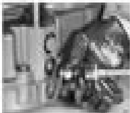
HOW TO USE The product is used in the kitchen.