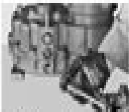
HOW TO USE The product is used in the kitchen.