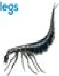
Water beetle larva