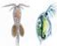
Water fleas (hydra and daphnia)