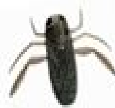
Lesser water boatman