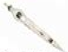
Phantom midge larva