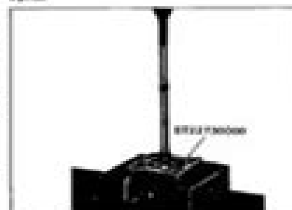
Fig. TB-29 Removing main drive bearing

18. Remove the main bearing from the main shaft by the use of a bearing puller (special tool BT-22100000) and a pin.