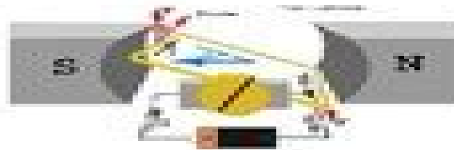
The motor principle