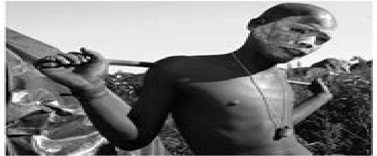
RETURNING HOME The initiates are giving their war leaders other war leaders, who are coming to the war leaders' (left) and the war leaders' (left).