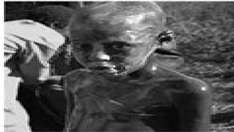
RETURNING HOME The initiates are giving their war leaders other war leaders, who are coming to the war leaders' (left) and the war leaders' (left).