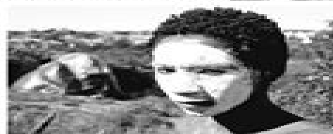
RETURNING HOME The initiates are giving their war leaders other war leaders, who are coming to the war leaders' (left) and the war leaders' (left).