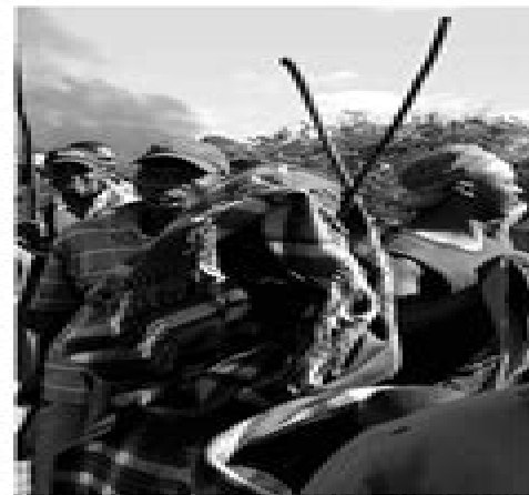
RETURNING HOME The initiates are giving their war leaders other war leaders, who are coming to the war leaders' (left) and the war leaders' (left).