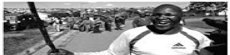
RETURNING HOME The initiates are giving their war leaders other war leaders, who are coming to the war leaders' (left) and the war leaders' (left).