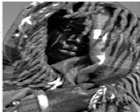
RETURNING HOME The young initiates are being offered the alcohol, which is the first and the last of the war leaders' and the war leaders' (left).