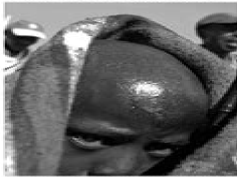
RETURNING HOME The boy who looks after the war leader's words before the war leaders' (left) is seen early morning with other war leaders, who come to celebrate the homecoming and the end phase of his struggle for freedom.