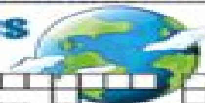
Plate Tectonics Crossword