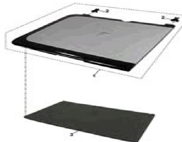
DOCUMENT PRESSURE PLATE